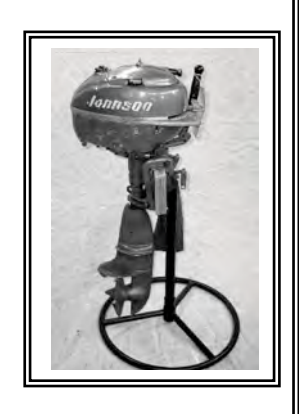
1953 TN-28 List price $187.50