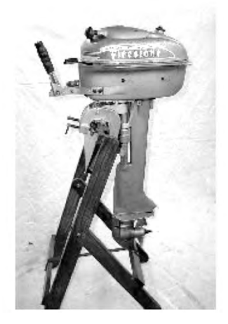
1953 Firestone 5hp

The Firestone had excellent compression, the Forward-Neutral-Reverse gears functioned and all the parts were present save a few fasteners. As I was waiting for the carburetor cleaner do its thing in the tank and carb, I removed the flywheel to find the magneto coils totally deteriorated. Knowing the high cost of new Wico coils it spawned the idea for the Wico/OMC coil replacement article that appeared in the KNUCKLE KNEWS two years ago. And while I certainly don't lay claim to being the first to swap OMC coils into a Wico magneto, this motor gave me the inspiration to try something I otherwise would not have done.