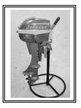
1954 CD-10 List price $210.00

The early 1950's were a time of rapid advancement in the outboard marketplace. Starting in 1949 Scott Atwater offered a full line of handsome full shift (FNR) motors and Mercury and Champion gave consumers blistering performance. And there were at least a dozen other brands; Martin, Chris Craft, Elgin and Flambeau, (just to name a few), vying for every single outboard sale. Based on the contemporary Abos guides, the 5HP class occupied a significant percentage of the marketplace and Johnson, by far the largest outboard manufacturer, was regarded by many as the "gold standard" that all outboards were judged against. The observations here are from my own experience owning, running and working on the two motors featured. This article is a brief look at two motors that were evolution and revolution - rarely have two products marketed back-to-back been so different.