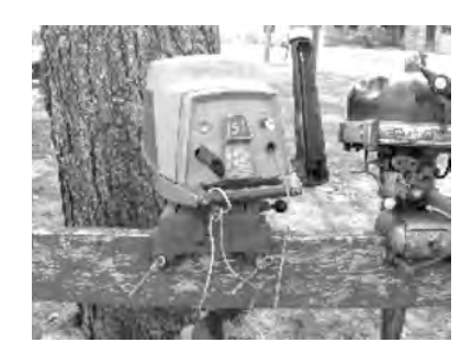
'56 Elgin As Found

Case #2) Another surprise was a little 1956 Elgin 5 ½ that, for $15, I saved from the smelter. At the Webster MA meet last year a member of the public just happened by and saw us setting up. He went home and dragged back a bunch of old outboards - I happened to overhear him say that anything he didn't sell that day was going to be sold for scrap. At 3:30 PM with the Mercs, Evinrudes and Johnsons all having found new homes, the only thing left was the Elgin. I couldn't stand to see it destroyed so I bought it.