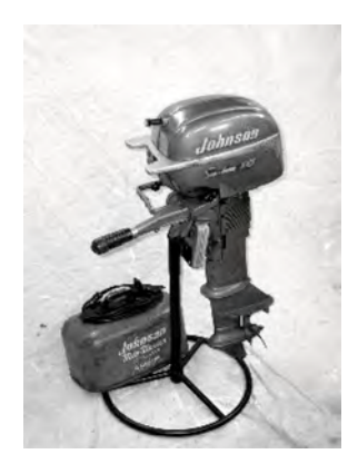
1953 Johnson QD-14

In this article I'm going to pick on you – if you can't take it then you may as well skip to the next feature! I have a favorite brand of outboard motor and, chances are, you do too. My natural inclination is to collect all of the Johnson outboards that I can get my hands on with a special fondness for the "T", CD and QD series. Without delving into deep psychological issues, let's just say I am comfortable with them and do you know what? – THIS IS A TERRIBLE THING!