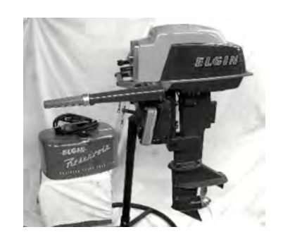
Cleaned Up & Ready to GO!

At home I was really surprised at how nice it appeared once 50 years of grime was cleaned away. Previously I had never even looked twice at the fiberglass hooded Elgins but, now that I had one, I was very impressed at how easy it was to work on. Everything was of a nice, straightforward design and, except for the wire throttle cable, all the components were exceptionally well engineered and thought out.